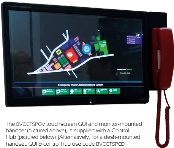
The BVOCTSPCM touchscreen GUI and monitor-mounted handset (pictured above), is supplied with a Control Hub (pictured below). (Alternatively, for a desk-mounted handset, GUI & control hub use code BVOCTSPCD.)